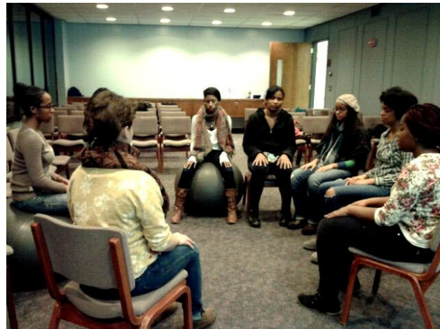
MAPS Members practicing meditation techniques